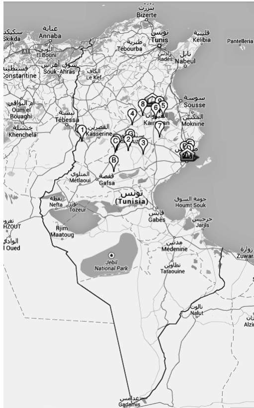
🏠: Regional offices, (1-9, A-G): Producers

consider the problem of transporting different types of live animals from farms to slaughterhouses by means of multi-compartment vehicles. They add time between consecutive tours to allow for unloading and disinfection of the vehicles. Hvattum et al. [19] deal with a tank allocation problem arising in the shipping of bulk oil and chemical products by tanker ships. They consider that a cleaning activity is required if two incompatible products are assigned to the same compartment within less than three trips.